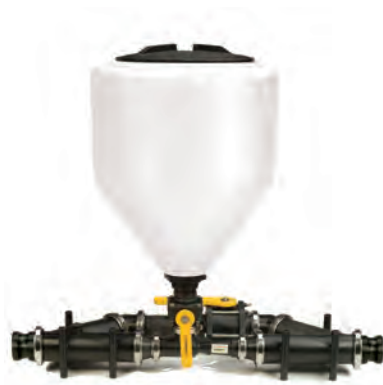
Front View w/ Tank