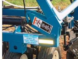
Heavy duty wing hinge with extra long hydraulic pin slot for extra wing travel – 2" greaseable pivot pins