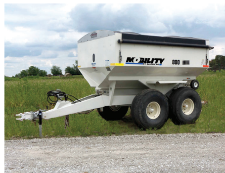
Mobility 800 (8 Ton)