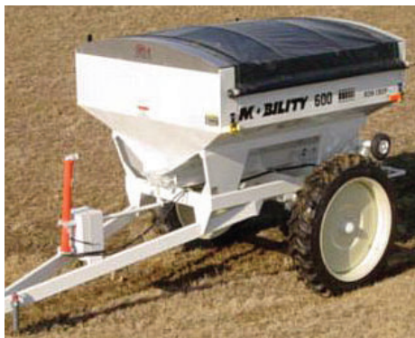
Mobility 600 (6 Ton)