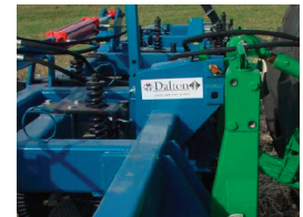
3 point hook-up