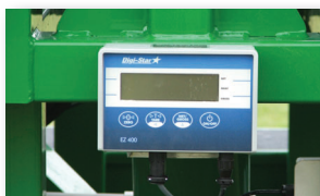
Optional Scale Head