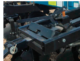
Pull out and swing away wagon hitch