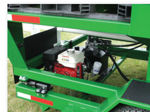
Self-Contained Hydraulic System