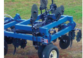
Flat fold outer wing with mechanical lock-down