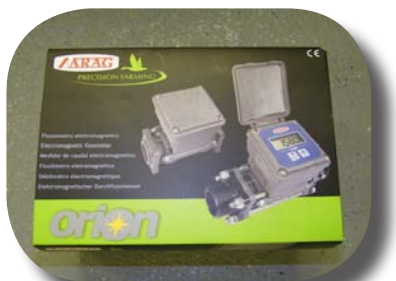
Orion Flow Meter