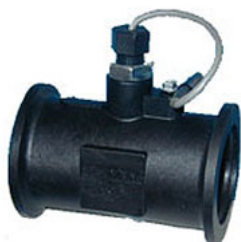
Raven Flow Meter